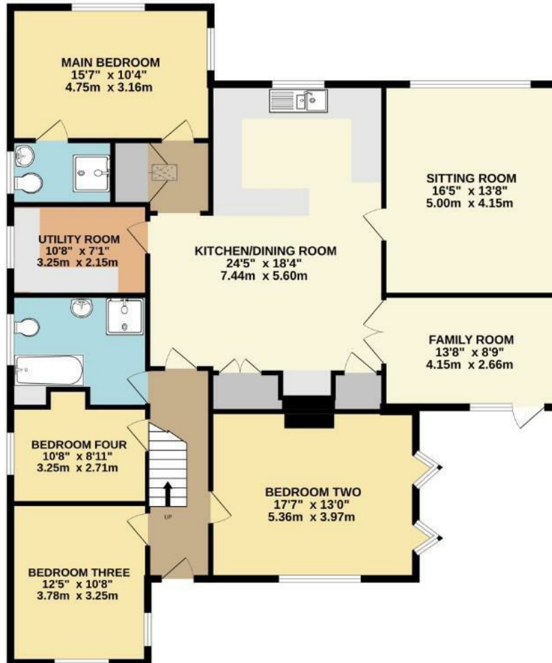
GROUND FLOOR 1651 sq.ft. (153.4 sq.m.) approx.